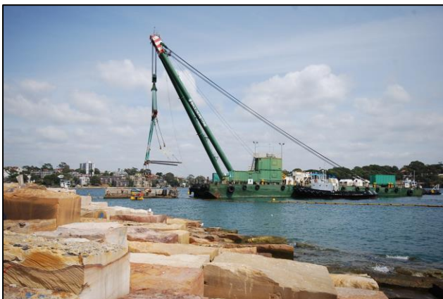
Removal of Caisson 1